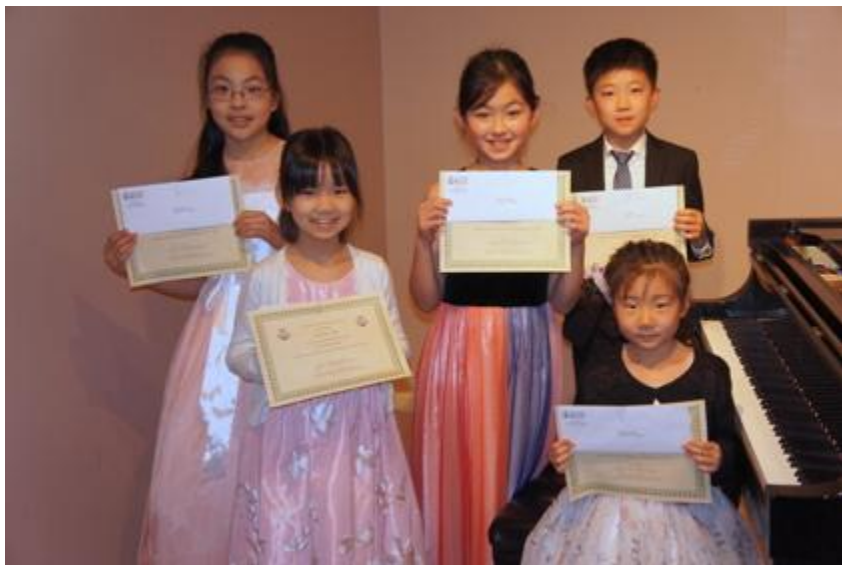
Groups 1 & 2 Winners