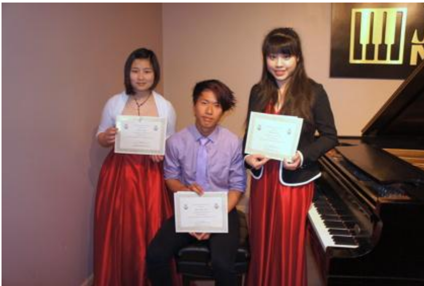
Group 5 winners