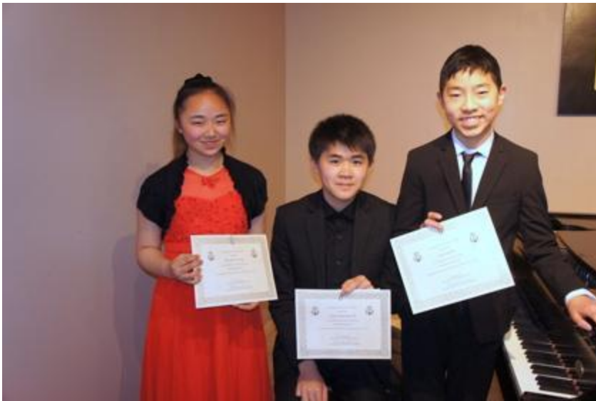
Group 4 winners