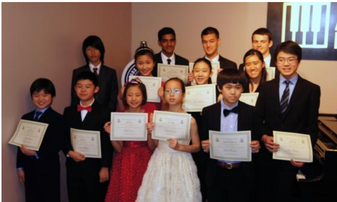
All the placed scholarship winners at the winners musicale May 4th, 2014