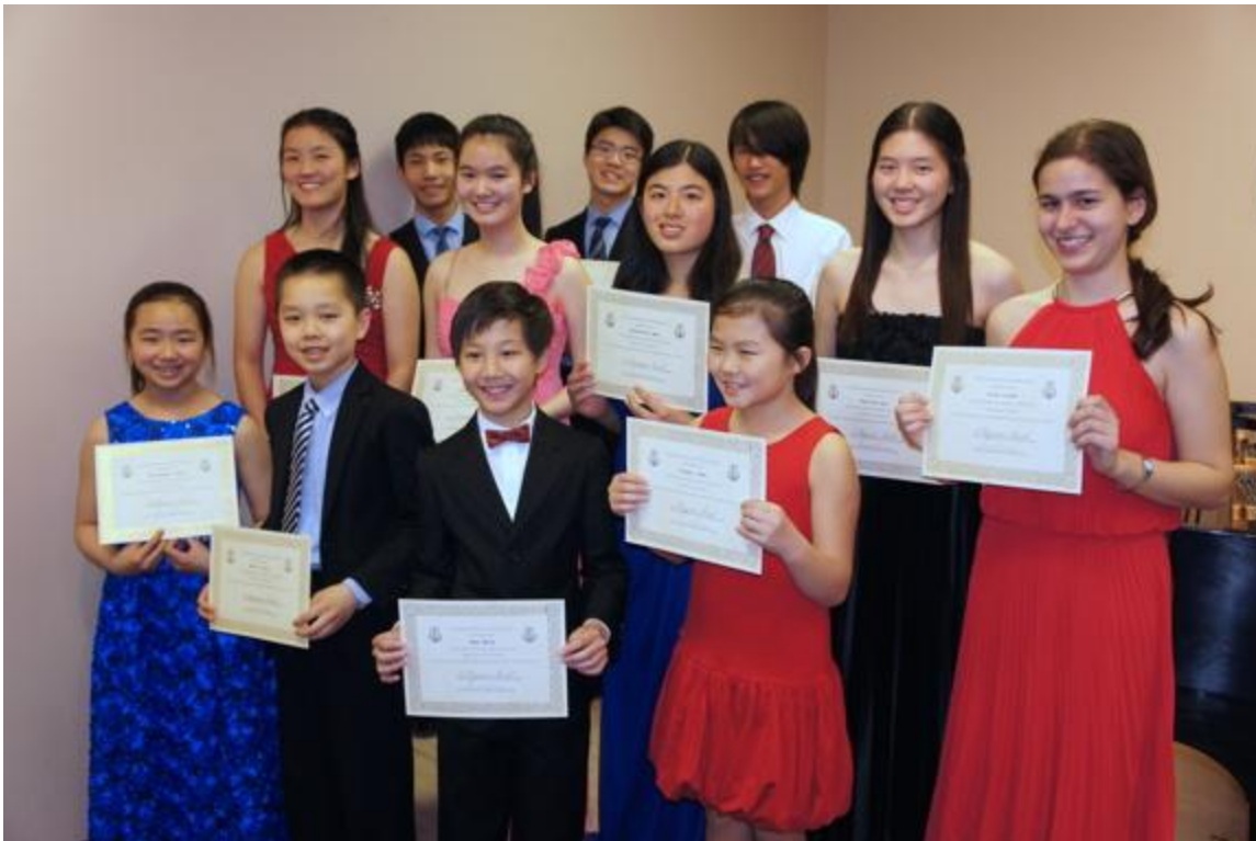
The scholarship winners at the winners musicale April 26th, 2015