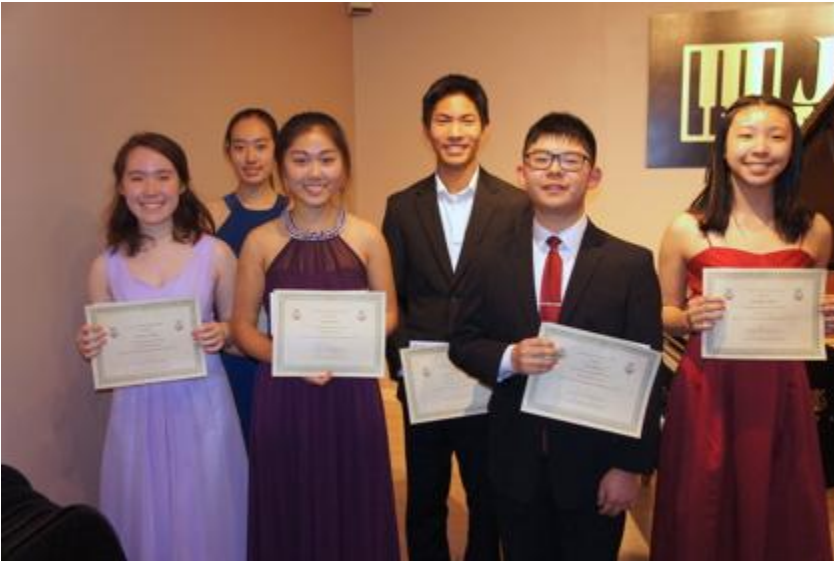
Group 4&5 Winners