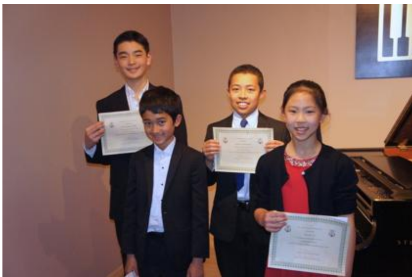
Group 3 Winners